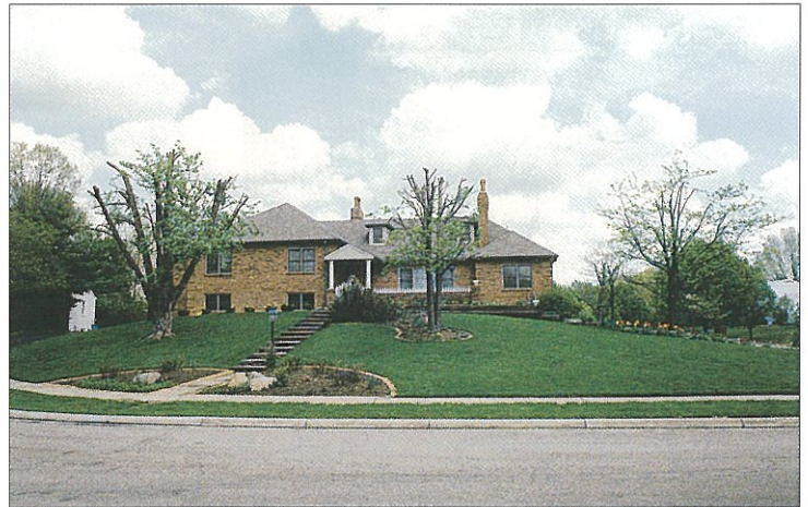
The trees on this beautiful lot have been topped. The beauty and the value of this property have been greatly decreased.

Topping invites internal decay. When a branch is correctly pruned at its point of attachment (Figure 2) to the trunk just outside of the branch collar and the branch bark ridge, internal decay is usually stopped from progressing into the trunk by a barrier inside the collar. Also, a correct cut results in more rapid wound closure so that the bark quickly grows over the injury.