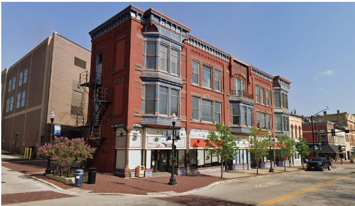
Proposed Iron Wings Tattoo studio would be located on the 2 nd floor of the building at 63 Douglas Avenue in Unit 201

The studio would have up to 3 stations for tattoo artists. The hours of operation would be by appointment only from noon to 8 pm Monday – Saturday. The applicant is not proposing any exterior changes to the building and only minor interior changes for the installation of a new sink, new flooring and decoration on the interior of the unit.