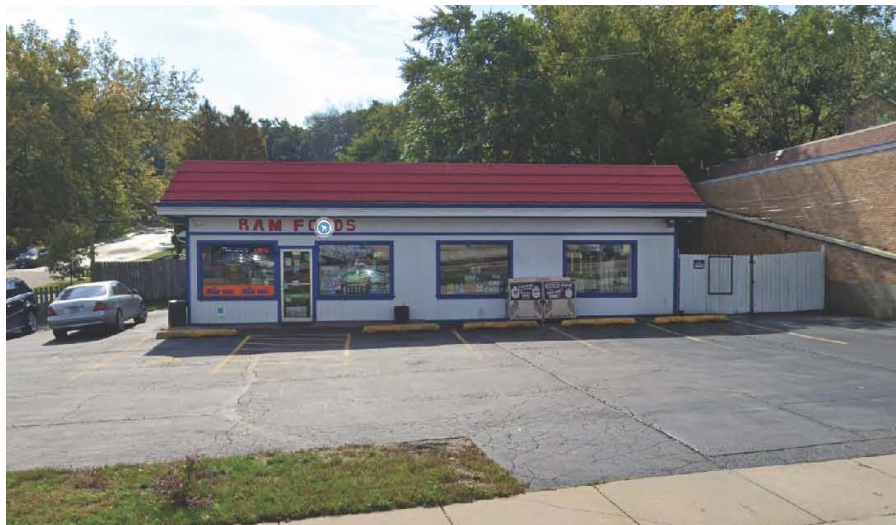
Ram Foods convenience store at 725 W. Chicago Street

The applicant is not proposing any other changes to the store operations.